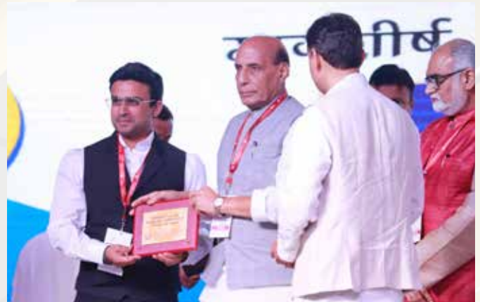
Shri Dhruv Galgotia, CEO, Galgotias University with Hon'ble Shri Rajnath Singh Ji, Union Defence Minister of India