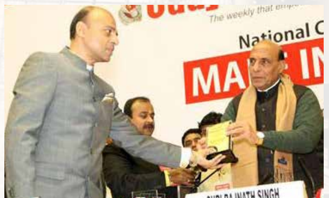
Shri RAJNATH SINGH Hon'ble Former Union Home Minister conferring award at Galgotias University