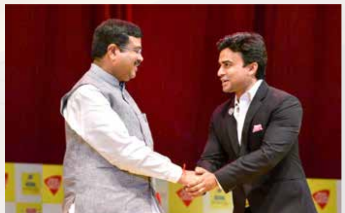
Shri Dhruv Galgotia, CEO, Galgotias University with Hon'ble Shri Dharmendra Pradhan, Education Minister (Govt. of India)