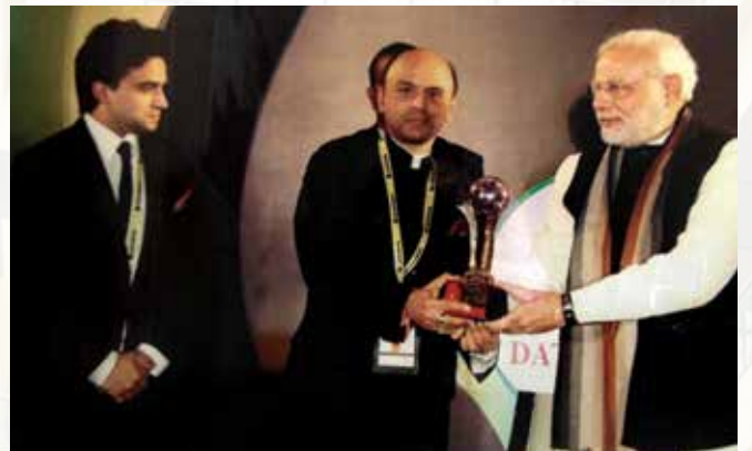
Mr. NARENDRA MODI, Prime Minister of India, conferring the DQ ICT AWARD to Galgotias University