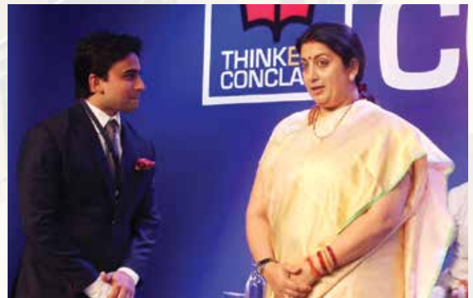
Shri Dhruv Galgotia, CEO, Galgotias University with Hon'ble Smt. Smriti Zubin Irani, Union Cabinet Minister